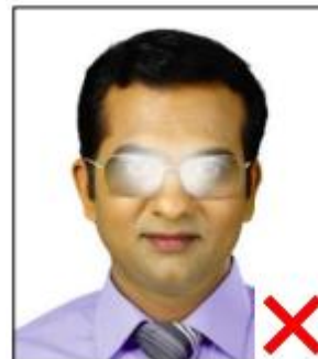
Flash reflection on lenses