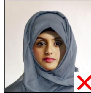
Shadow across face